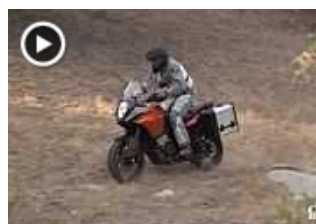
TEN BEST BIKES VIDEO-BEST ADVENTURE BIKE: KTM 1190 Adventure